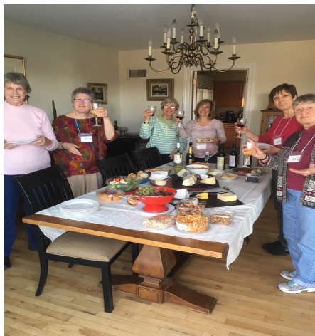
Memories of workshops-past and the promise of more great workshops to come!